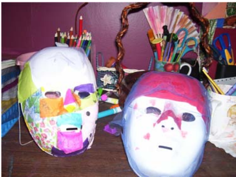
Masks created by children in Expressive Art Therapy

Diane uses Expressive Art Therapy especially in dealing with children. Expressive Art Therapy is a way to express feelings without words. If a girl is experiencing a broken heart, drawing this reality with charcoal and deep red colors can open new doors to feel and heal. Diane uses drawing, poetry and movement to connect to deep places in children's lives.