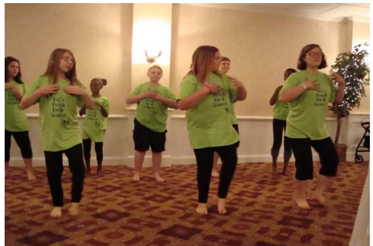
The Let's Roc dancers are a youth initiative of the Suicide Prevention Task Force whose aim is to promote the Reach Out and Connect campaign. Eight students performed magnificently at the annual dinner! Great dancing and a great message.